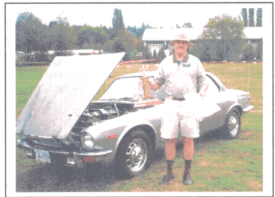
Me and my Jag XJ6C "Shirley"