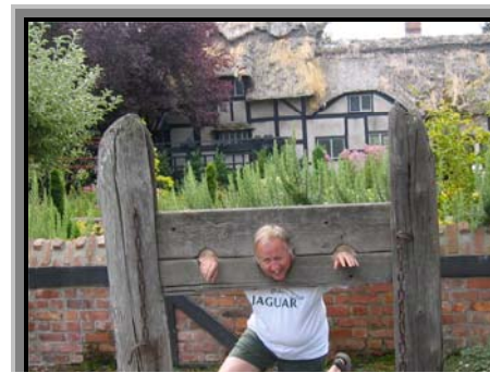
Ann Hathaway's Cottage and (above) Malcolm in Stocks ( Was it for misuse of Ye Olde English Language? )

Thou shalt be amazed at the wonderful places en route and thou art truly encouraged to partake of thy camera to capture these magnificent sights. At the lunch hour of that fine day, thou shalt stop at a mystical inn alongside the ocean of the Pacific and feast upon traditional English fare, while drinking an array of well-brewed ales and beverages, served by the welcoming wenches therein.