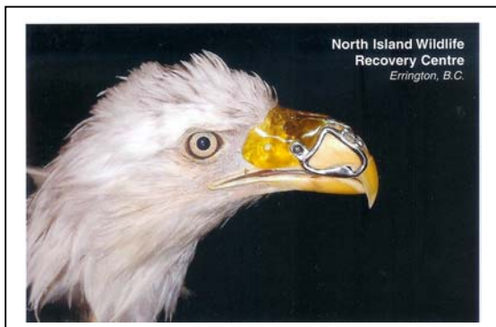
(Above) Brian the Eagle and his fancy prosthesis