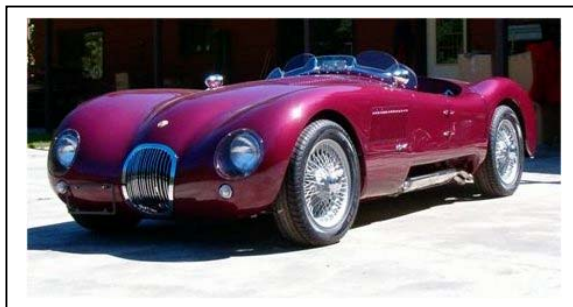
Chris Masterman's C-Type Jag Replica

Thought you could mention that I've finally finished construction of my Jaguar C Type replica, and perhaps include a picture. The car is powered by a 1967 4.2 litre engine from an E type, runs on triple SUs, has a 4 speed Moss gearbox with overdrive, and weighs just 1100KG so is very lively. It took 8 months to construct after receiving the body shell and chassis frame from the UK. I'll bring it along to a Nanaimo meeting before too long, provided its a dry evening. (Here's the photo, Chris – it looks great!..Ed)