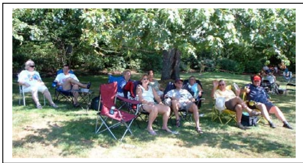
Relaxing in the Shade at the Filberg Show