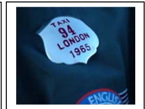
(Above) London Taxi Driver’s Badge; (Left) AA Grill Badge;