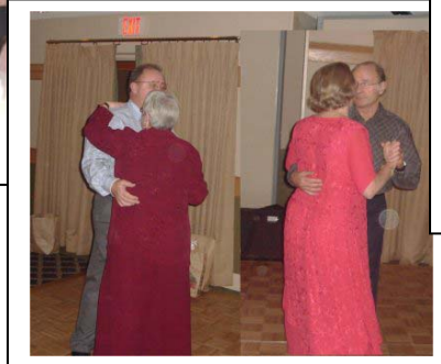
(Below) Dowells & Minters Hoofing it!