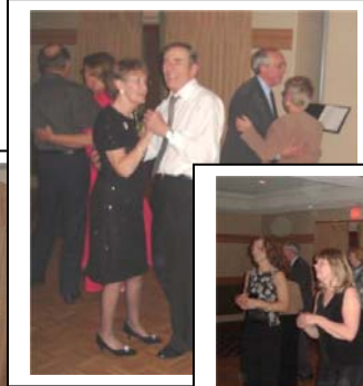
(Left) Thompsons & Hedges