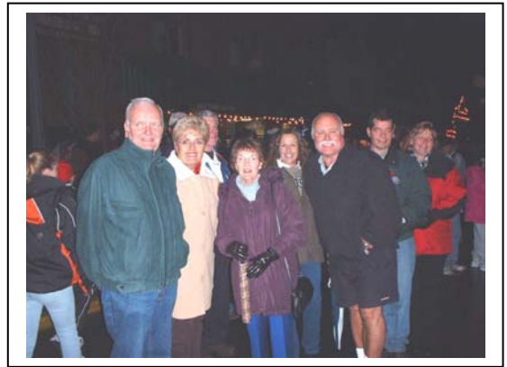
OECC Folk at Ladysmith Lighting Up

the parade. No old English cars out today though – all in daily drivers...Ed