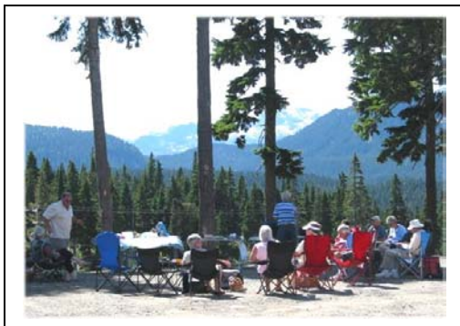
Picnic on Mount Washington

Despite prior warnings of major roadworks and huge crowds on Mount Washington, our picnic run up there encountered none of these problems. The weather was perfect as our ten cars made their way up-island and through Courtenay in a nice neat crocodile. In the middle of town though we somehow managed to do the old OECC thing and get split up. One group of 4 cars found their way up to the agreed meeting spot above the main lodge at Mount Washington with no trouble at all. The 6 others seemed to have had some serious navigation problems because they ended up almost to Campbell River before eventually finding the right route up the mountain. Happily, we all eventually found each other and had a most enjoyable potluck lunch looking out at the beautiful views of the Comox glacier. After lunch and chats, some went up the ski lift to the very top of the mountain, others dallied around before making the run home. Another enjoyable car club run... Ed