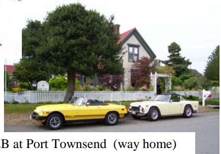
B&B at Port Townsend (way home)