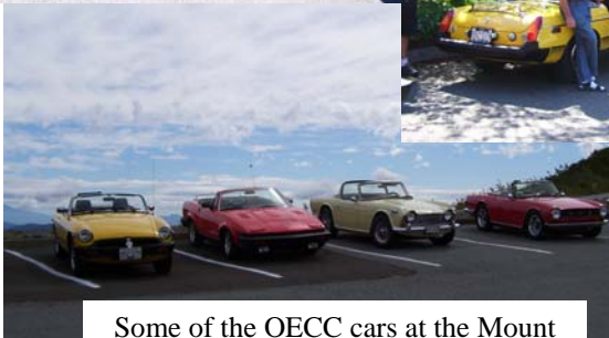
Some of the OECC cars at the Mount St.Helens lookout