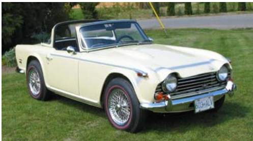
Adèle & Ken Hedges took second place in the Peoples Choice with their Triumph TR250