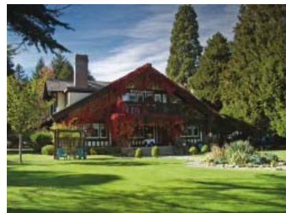
Maclure house at the Beach Acres resort in Parksville was the terminus of our rally.