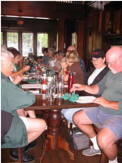
Look at those legs!!!