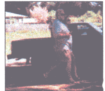
Who is this strange couple at the AGM?

First I would like to thank everyone for the democratic vote of "YOU'RE IT"!!