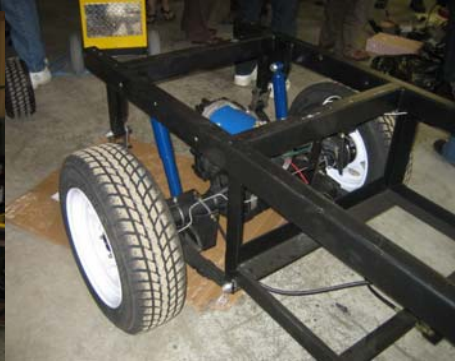
Rear axle and drive train