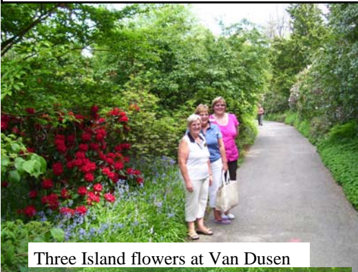
Three Island flowers at Van Dusen