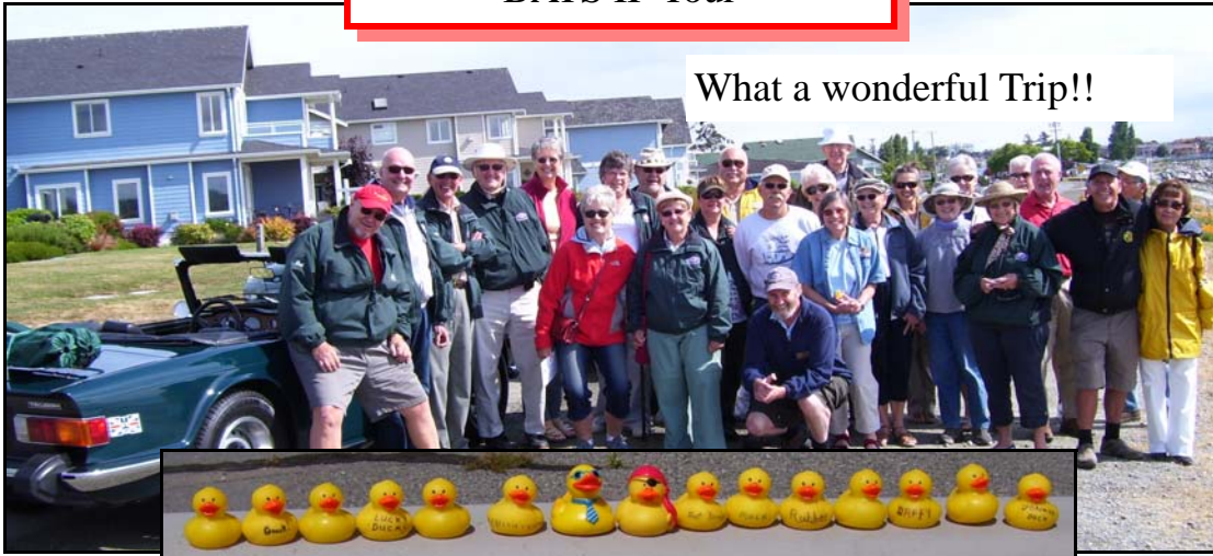
What a wonderful Trip!!