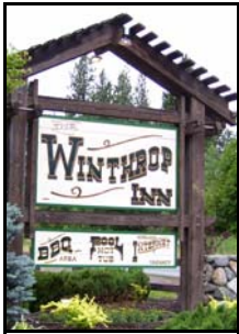
Elvis Lives On