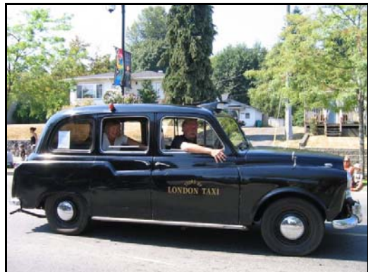
Another London Taxi in the club Always a hit with the public.