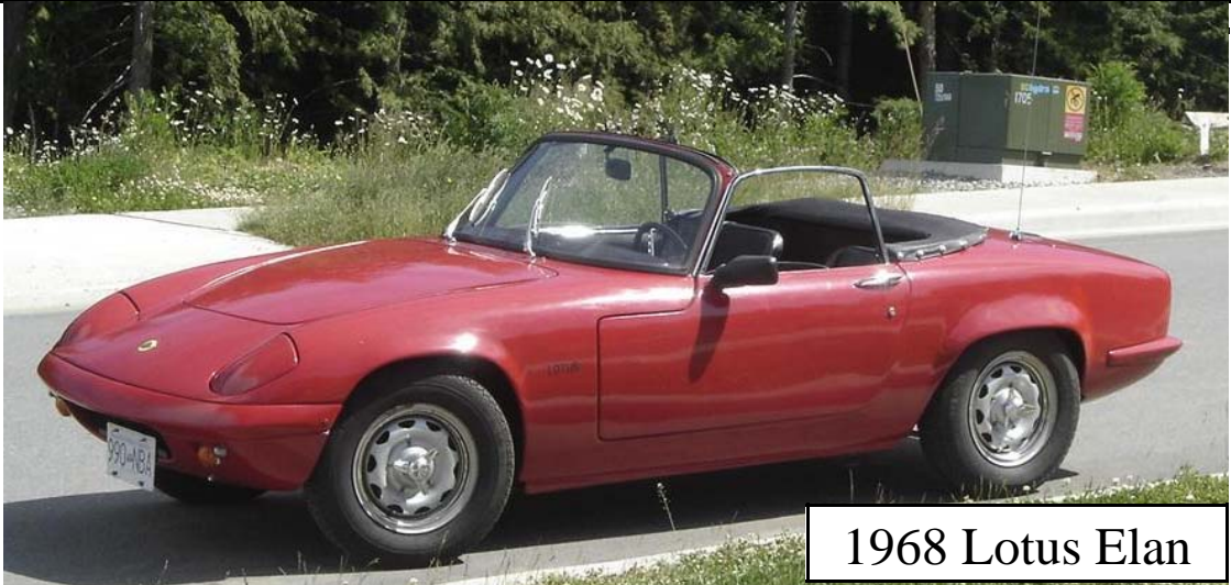
1968 Lotus Elan

The car here is a recent picture of my Lotus Elan. I purchased it in poor running condition for $1100 in Montreal in 1974, and there began my long term relationship with this little beast. Owning other British cars (Alpine, MGB, Spitfire, TR7) since I was 16 years old, and with limited funds, pushed me to develop some mechanical repair expertise or spend all my money at the mechanic shops. I managed to develop a good mechanical capability with hands-on repair experience, so I did not think that maintaining a Lotus Elan would be a significant challenge. It was not.