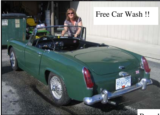
Free Car Wash !!