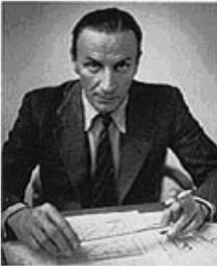
Alec Issigonis 1946 (5)

This is Part One of Two regarding Alec Issigonis, designer of, amongst others, the Morris Minor, the Mini (Morris Mini