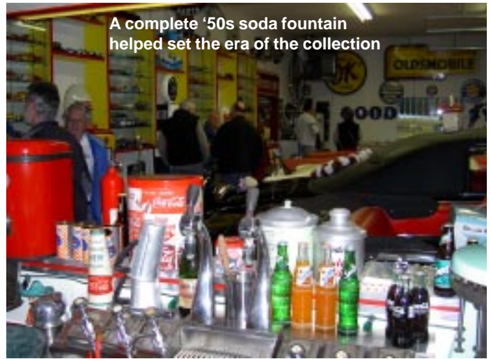
A complete '50s soda fountain helped set the era of the collection