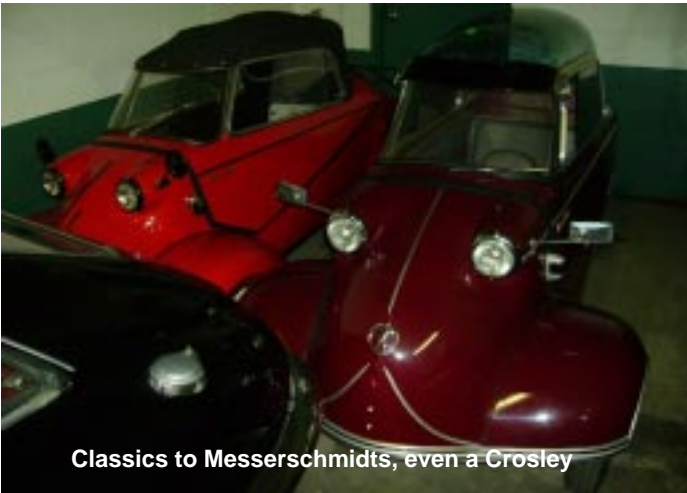
Classics to Messerschmidts, even a Crosley