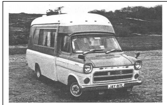
The 1972 Ford Transit Landliner

We travelled the entire coast of England, leaving Wales and Scotland until our next trip as we ran out of time, perhaps because we found too many great pubs, and auto-jumbles which happen every weekend from January until December, somewhere. I was able to find every spare part I needed for our 4 English cars, even a pair of seats for our Commer, which I bought from a CCC member in Dorset. Getting them into my suitcase took some ingenuity let me tell you! I put them into a card-board box and brought them back as a piece of luggage, no problem said Air Canada who bumped us up to Business Class at no-charge!