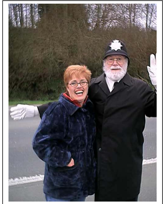
Quit fraternizing with the Constabulary!

From all accounts, that Rolls would now fetch over £100,000. That’s big Pounds folks!... Ed