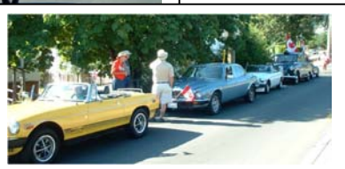
The Back ▶ of our Line