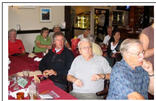
▲ Everyone's concentrates hard to hear who won the Scavenger Hunt!