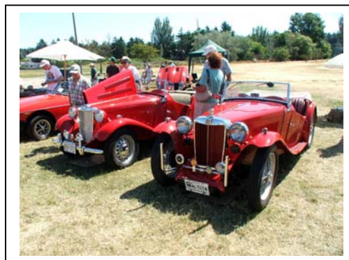
▲ Nice Old MGs at the Cadboro Bay Meet