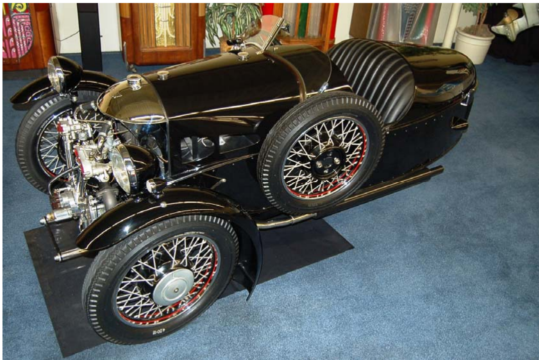
1934 Morgan Super Sport

I was recently in Las Vegas and took the time to drop in to 'The Auto Collections' located at the Imperial Palace hotel. There were many fine automobiles displayed there and probably at least half of them British. I took quite a few photos and will share them in the Beano in the coming months. Almost all the cars were for sale but I'm afraid most were quite out of reach. For those interested in Rolls Royce, there were at least 24 of them present