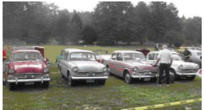
Row Of Minxes At Car Show

Ultimately, we decided to attend without our car and looked on it as an adventure. We flew to Akron, Ohio, and rented a car. Upon arrival in Streetsboro, we quickly discovered that any concerns we had were unfounded. We had a wonderful time and met some fabulous people. I don't know why we were apprehensive. After all, they were all Rootes car owners so how