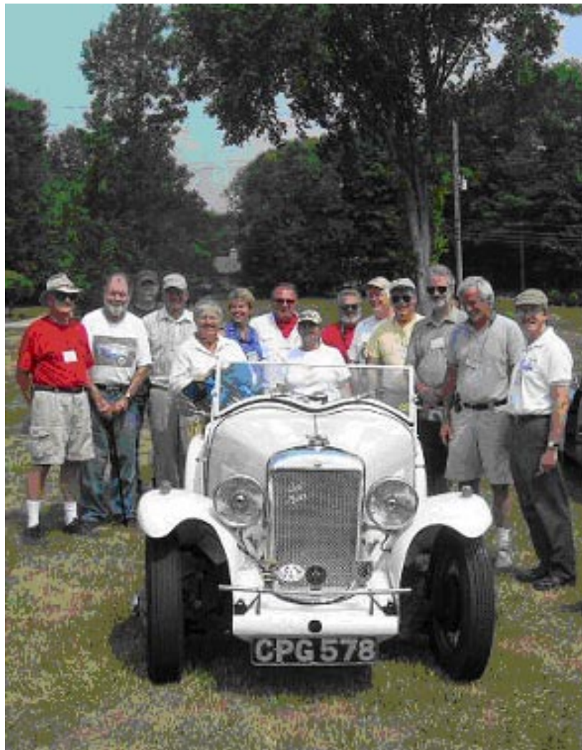
Best In Show!