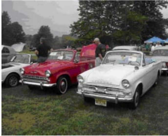
Row Of Minxes At Car Show

At the closing dinner the night before it had been decided that this would become a biennial event so we look forward to seeing many of the same folks, and hopefully more new Rootes-a-holics, in 2009.