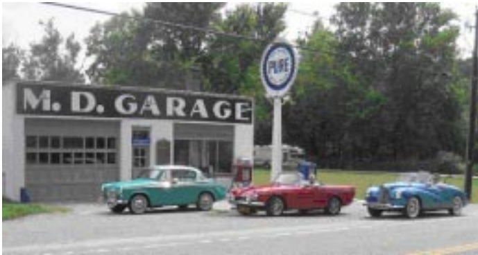
Series II Rapier, Tiger, and '53 Alpine

I was very keen on attending this event as there are very few Hillmans or Sunbeam Rapiers in this area plus I was inter-