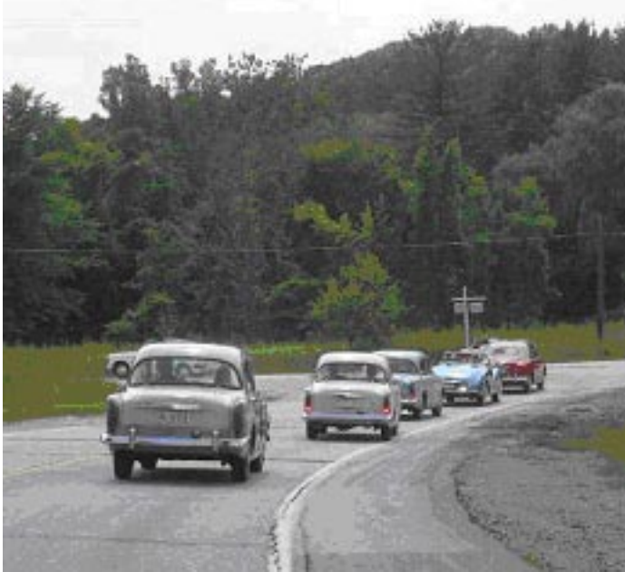
Goin' Down The Road